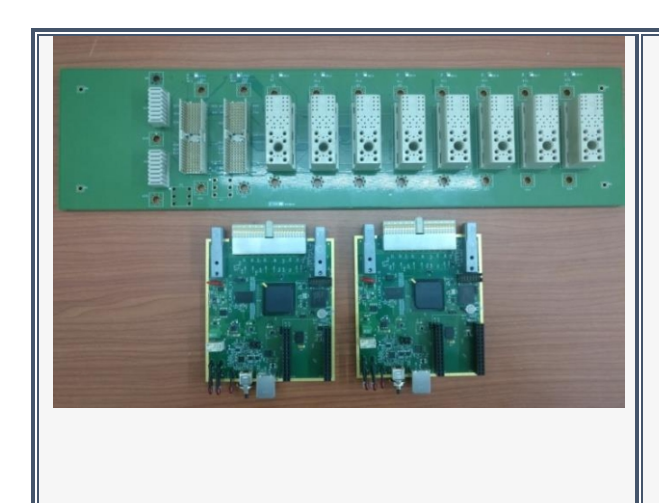
Table 1-RUGGED BACKPLANE CARD

AN ISO 9001:2015 CERTIFIED ELECTRONICS SYSTEM DESIGN AND DEVELOPMENT COMPANY